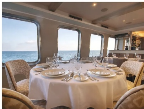
ECOVENTURA: COURTESY PHOTOGRAPHY; BLUE FOOTED BOOBIES: PHOTO BY YOLANDA ESCOBAR; ALL OTHER PHOTOS: COPYRIGHT TERNAUDO SANCHEZ/ISTAR

Many cruise companies offer trips through the islands, and my husband and I spent quite a bit of time considering the options. We liked that Ecoventura is part of the Relais & Châteaux collection of luxury hotels and restaurants and that their yachts ( Theory , Origin , and Evolve ) each have ten cabins for a maximum of 20 guests per voyage. I was also aware that the national park stipulates a ratio of at least one qualified naturalist guide per 16 passengers, and Ecoventura provides two guides for 20 people.