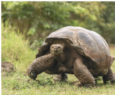
OPPOSITE BOTTOM Galápagos tortoises are among the longest lived of all land vertebrates, averaging more than 100 years. OPPOSITE TOP Whales can be found in Galápagos waters year round. MAIN Ecoventura yachts carry kayaks, SUPs, and snorkel gear for passengers. TOP LEFT Rangas are ideal for exploring the islands. TOP RIGHT Charles Darwin described marine iguanas as "hideous-looking." BOTTOM RIGHT Cactus is the preferred diet of land iguanas.