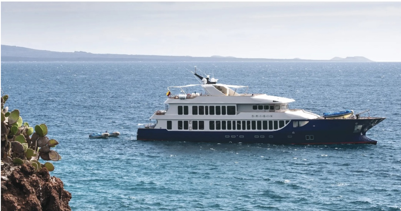
MAIN Origin is one of three identical Ecoventura yachts in the Galápagos OPPOSITE Ecoventura guests gather for great flavors and good conversation over dinner TOP Blue footed boobies use their feet to attract a mate and to cover their young and keep them warm MIDDLE Bright red Sally Lightfoot crabs are easy to spot against dark volcanic rock throughout the Galápagos BOTTOM Male Great Frigate birds inflate their neck pouch to attract females during courtship